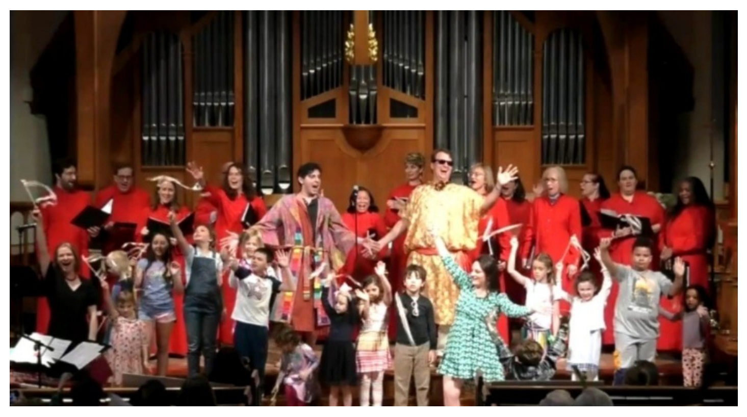
Joseph and the Amazing Technicolor Dreamcoat

Fifth Sunday of Easter April 28, 2024 10:00 AM